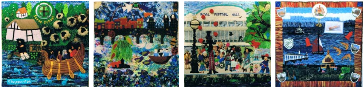
Some canvases created by schools that have already completed their work

The Thames Heritage Tapestry involves schools along the River Thames. Each school designs and makes a one metre square of textural embroidery to create a tapestry to reflect how the Thames has shaped and influenced the local communities it runs through. The project is designed to support and enrich the national curriculum; it will broaden knowledge of the river and develop a deeper understanding of its significance. The end result will be a multifaceted portrait of the Thames from its source to the estuary through the eyes of the children who live along its banks. Frankly, totally stunning.