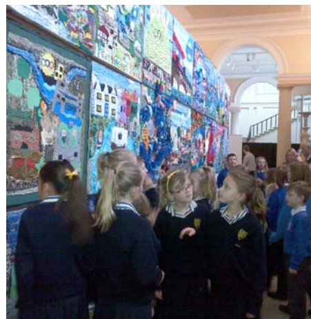
The exhibition in the Randolph Sculpture Gallery in the Ashmolean Museum, Oxford