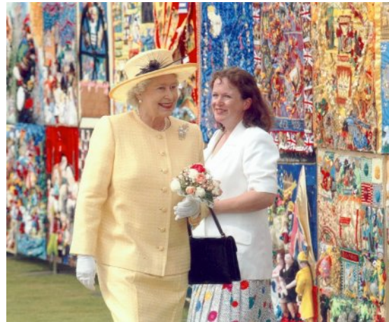
...and Golden Tapestries

enduring legacies of events or anniversaries; but they are also designed to help children learn about issues like caring for the environment, recycling and reducing energy consumption, accepting cultural differences as a means of promoting social cohesion and global citizenship and understanding disability.